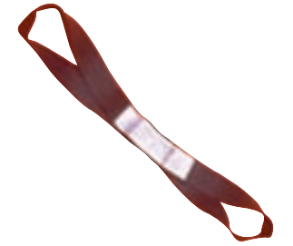
ELASTIC RETENSION STRAP