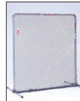
Seven-Footer® Square Screen