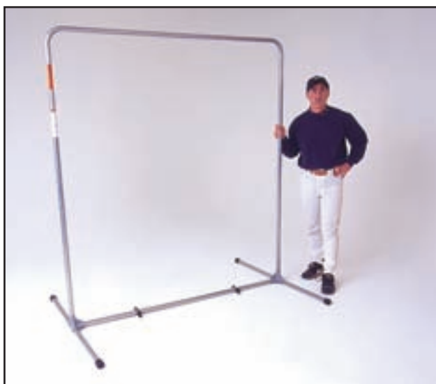
The frame of your JUGS Quick-Snap® Protective Screen is now complete.