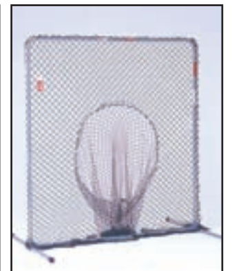
Seven-Footer® Square Screen with Sock-Net™